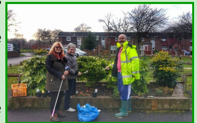
Bulb planting in communal areas on the estate.