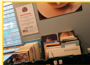
Our growing selection of books as part of the Book exchange.