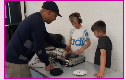
DJing workshop as part of our Youth consultation exercise